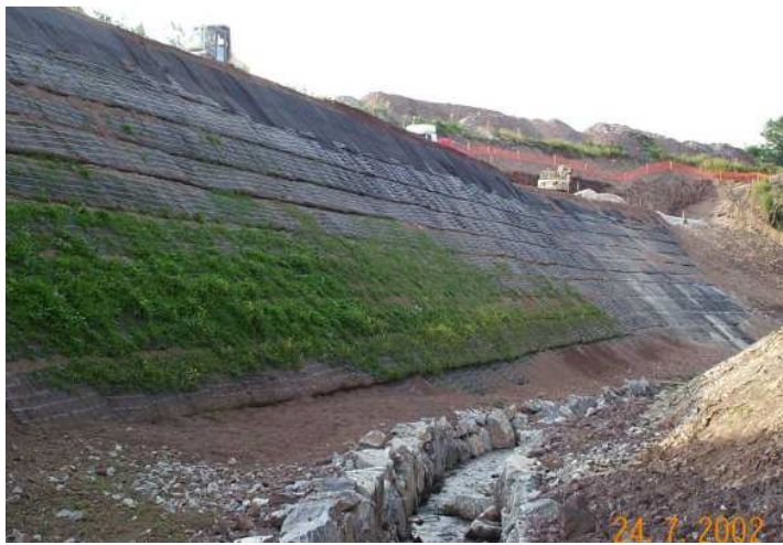
Consistent face profile achieved using the unique Tensor Bodkin connection

Construction was carried out without the need for any formal shuttering. A large steel plate was mounted on an excavator. This plate acted as a simple former to provide temporary support to the geogrid wraparound face.