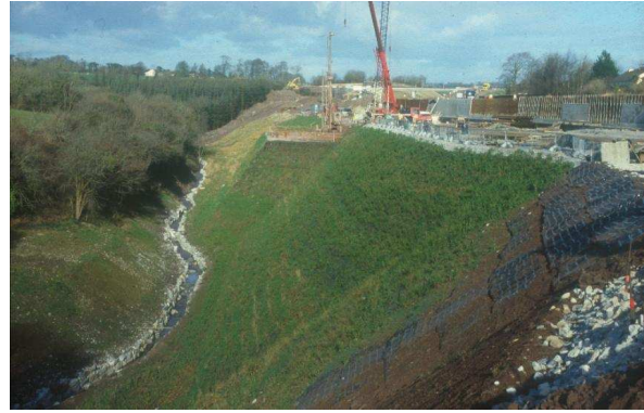
Construction of 20m high Tensar reinforced soil slopes.